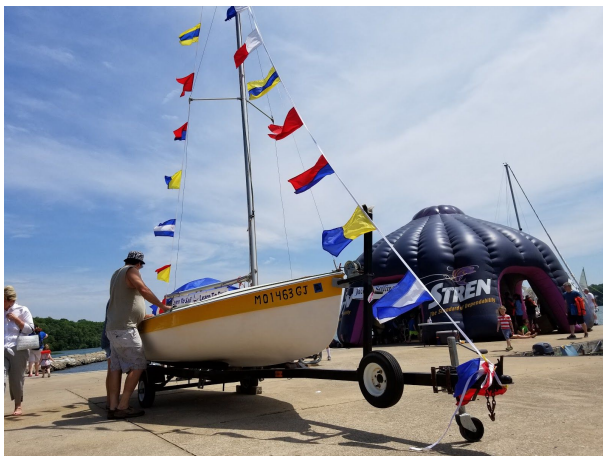
National Marina Day. JYC teamed up with JSC to entertain and educate local guests for this annual event. Together we volunteered over 80 boat rides to more than 300 visitors.